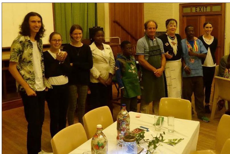
Members of the Rosebank Methodist A Rocha group preparing for their annual sustainable supper event.