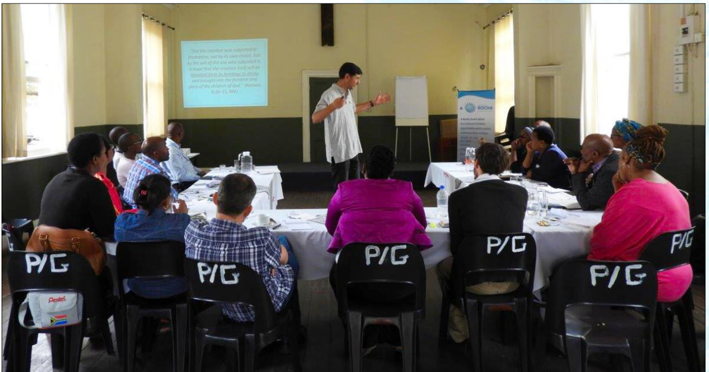
Workshopping 'A Biblical Motivation to Creation Care' with Pastors from the Pietermaritzburg area in partnership with Project Gateway .