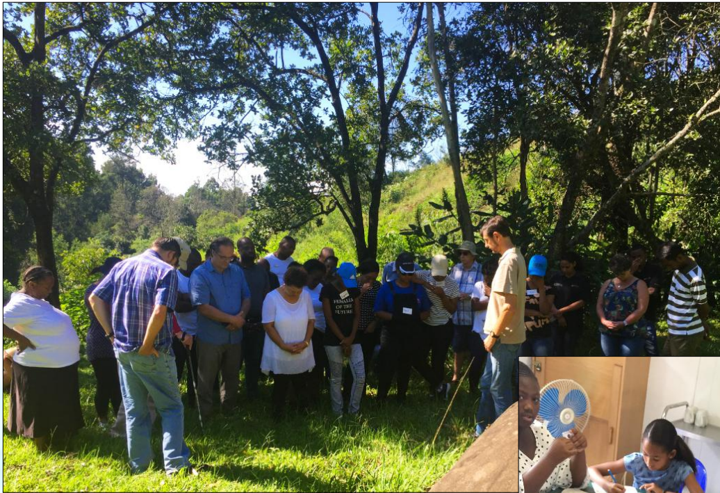
A Rocha leading outdoor devotions with the staff of African Enterprise.

2019 saw active A Rocha engagement with various church denominations through sermons, bible study series and engaging with Sunday school classes.