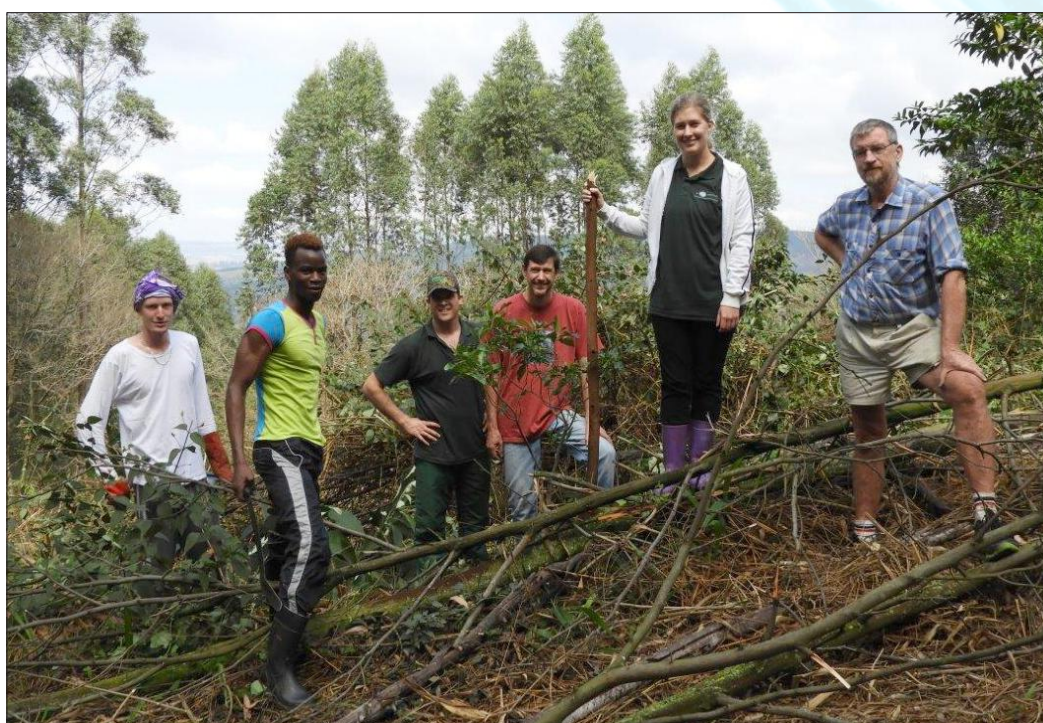
KZN Action Team members celebrating Arbor day at Ferncliffe Nature Reserve.