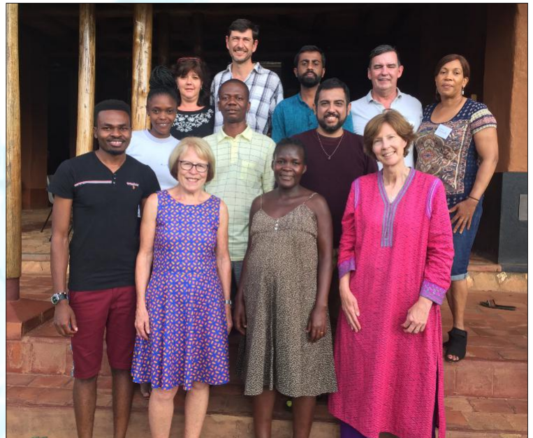
Delegates attending the Environmental Education conference in Kampala, Uganda.