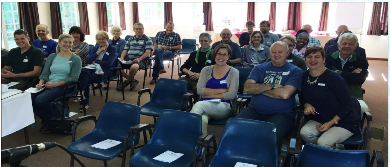
2019 A Rocha AGM held at African Enterprise, Pietermaritzburg.