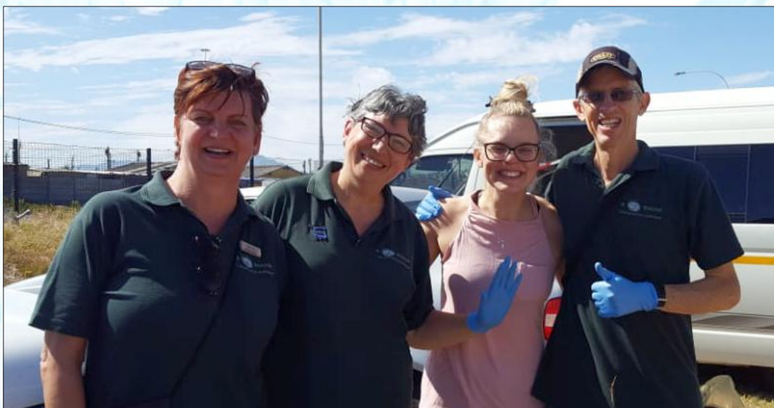
Cape Town Action Team members ready for a clean-up event in Khayelitsha..