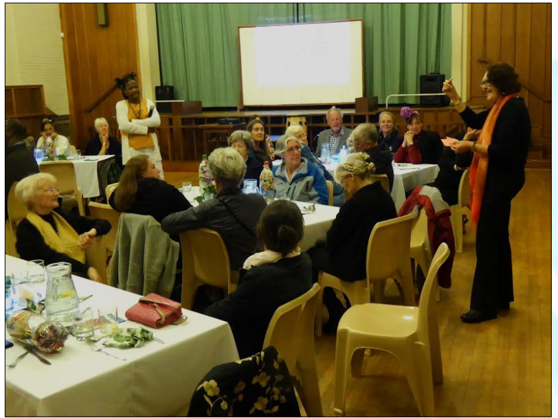
The A Rocha group of Rosebank Methodist Church explored the topic of practical solutions to plastic pollution at their annual 'Sustainable Supper' event.

Although there are many good reasons for environmental concern and action, A Rocha SA's foundational motivation emerges from a biblical theology of creation care. In furtherance of our ongoing mission to inform hearts and actions through theological engagement, 2019 saw A Rocha SA directly engaging with more than 650 people through church engagements, bible studies and creation care workshops.