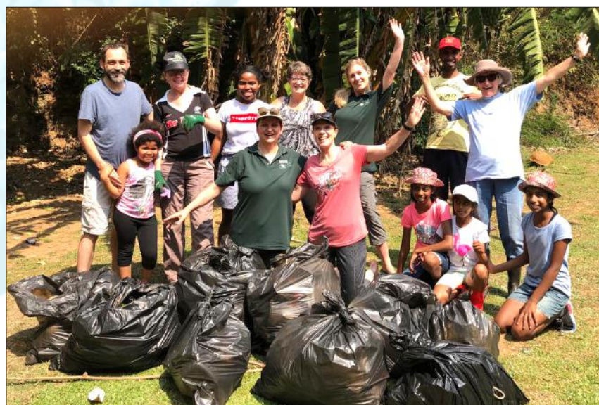
A Rocha KZN action team and African Enterprise collaborate for International Coastal Cleanup.