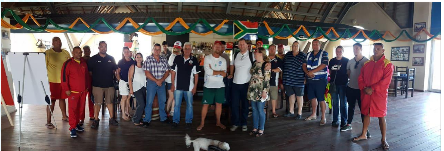
Members of the Bluewater Bay Surf Lifesaving Club and first responders who assisted at the scene of the accident. As the accident occurred a short distance from the lifesaving club, these lifesavers were the first on the scene to provide emergency assistance.